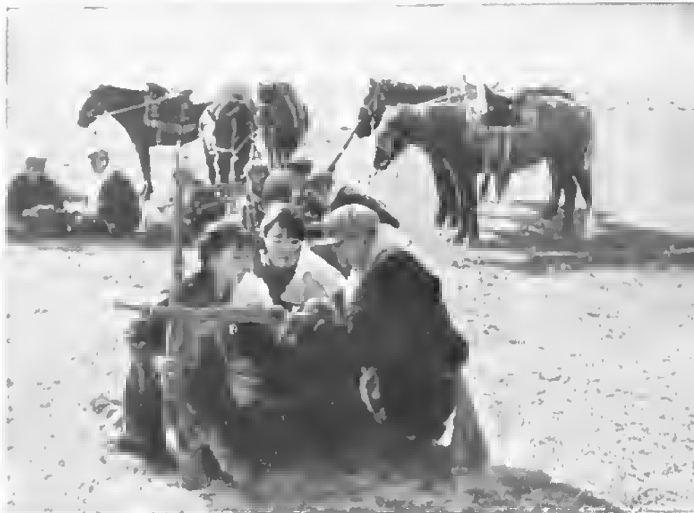
Deeply hating the U.S. imperialists and social-imperialists, herdsmen work hard at military training, getting ready to wipe out aggressors.

Three years of the Great Proletarian Cultural Revolution brought an even greater change.